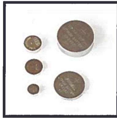
Lithium Metal Button Cells (Acceptable)