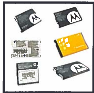
Li-Ion Cell Phone (Acceptable)

For batteries larger than the common consumer types shown above, customer should verify whether batteries can be shipped pursuant to Special Permit 16474.