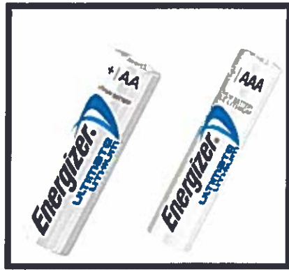
Lithium Metal AA & AAA Cells (Acceptable)

Most consumer-style lithium metal and li-ion batteries (see below) fall within these size limitations.