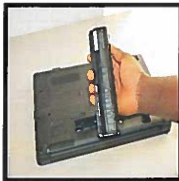
Li-Ion Laptop (Acceptable)