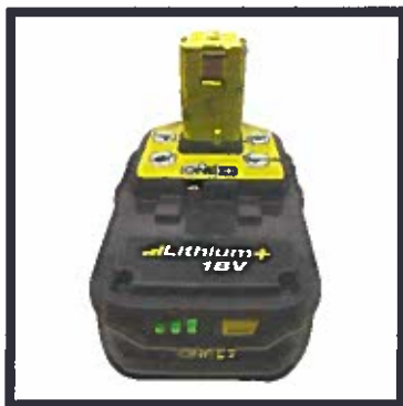
Li-Ion Power Tool (Acceptable)